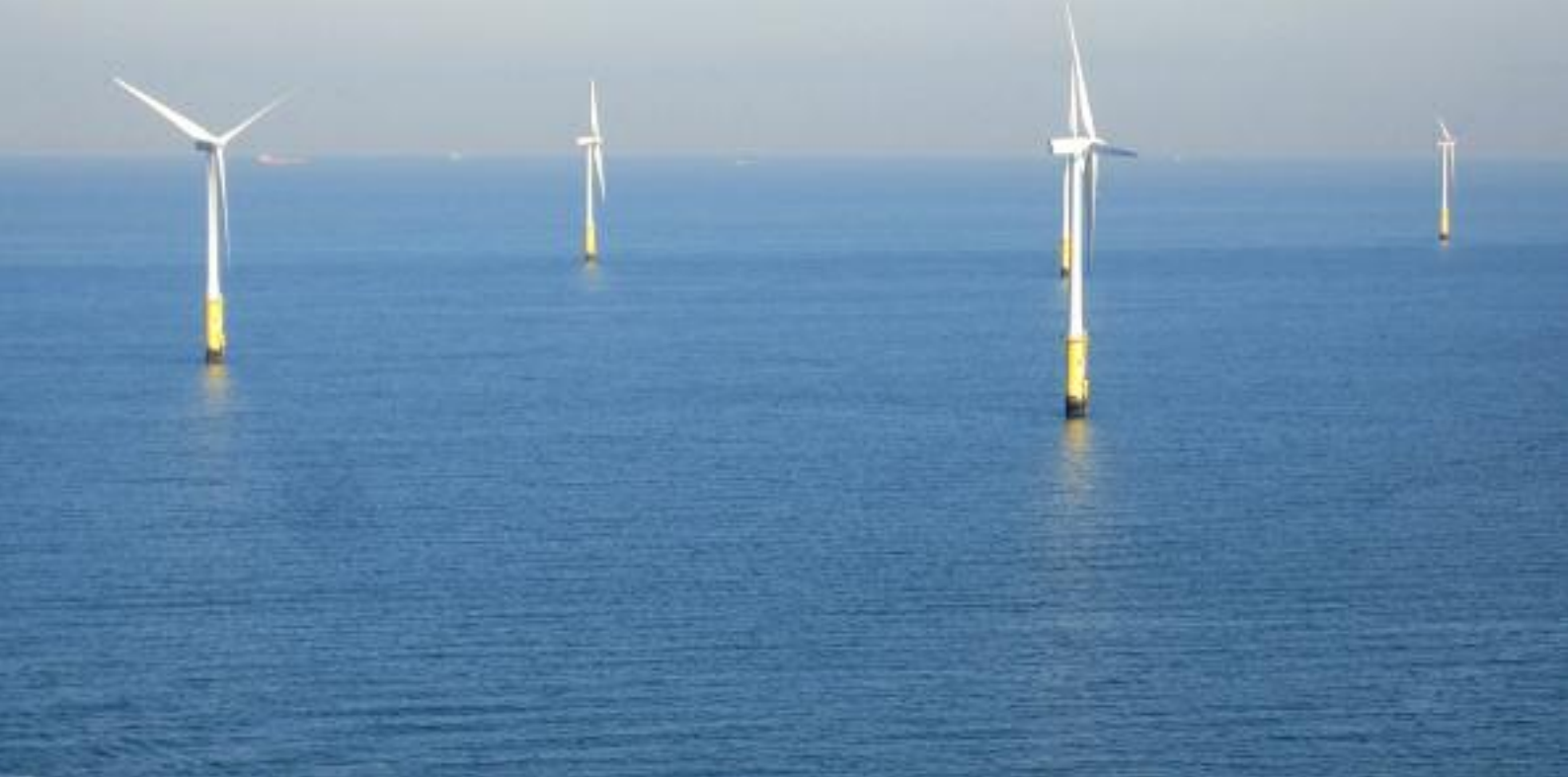
Burbo Bank wind farm