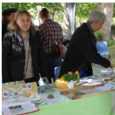
Join a transition group. Transition Town West Kirby