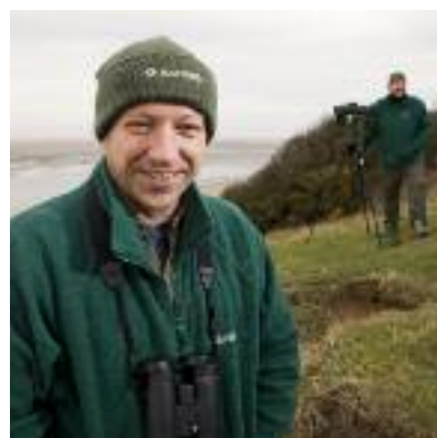
Get involved in practical conservation