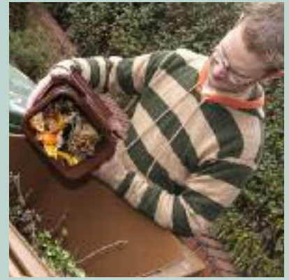
Reduce, Re-use, Recycle