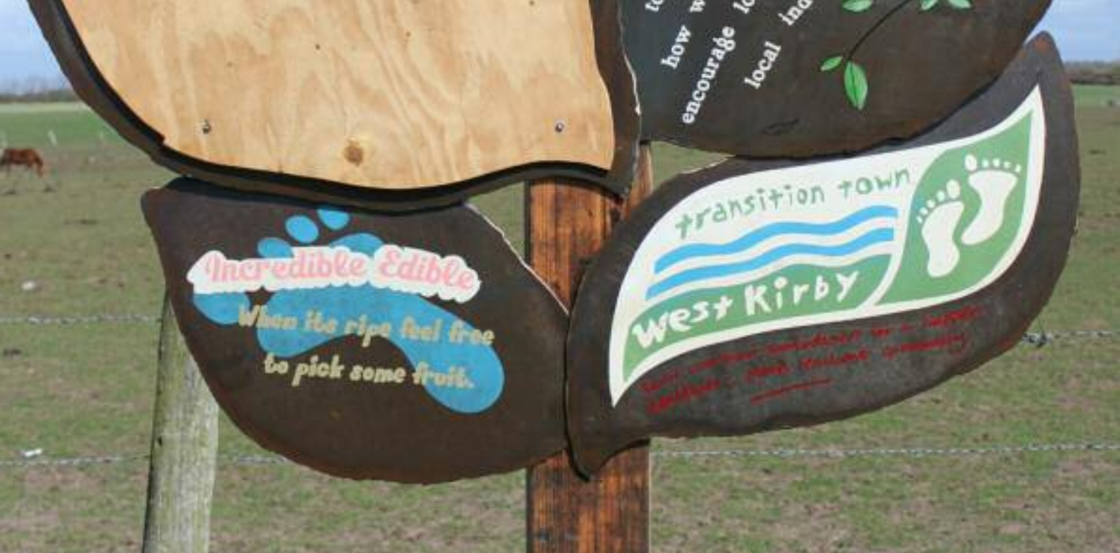
Apple Avenue. Transition Town West Kirby.