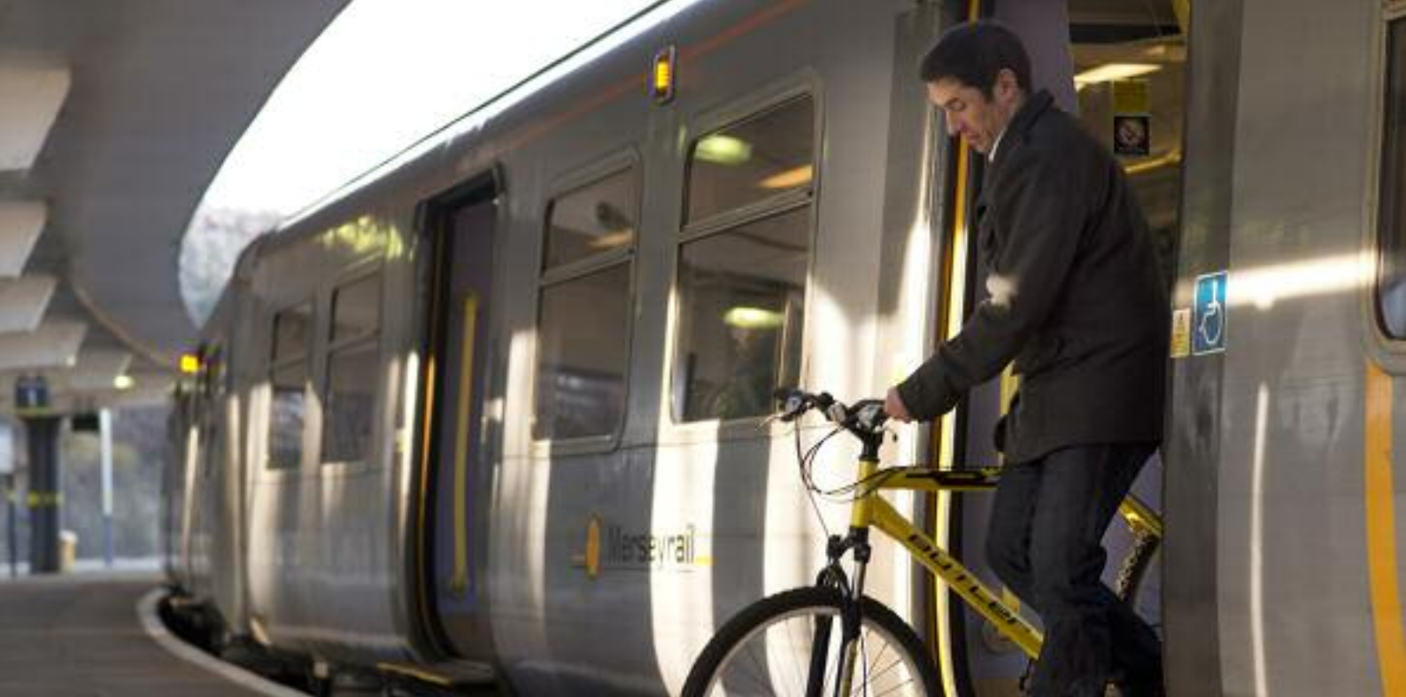
Merseyrail Wirral Line