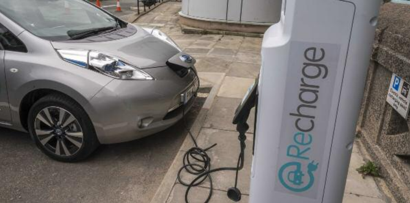
Vehicle Recharge point, Seacombe Ferry