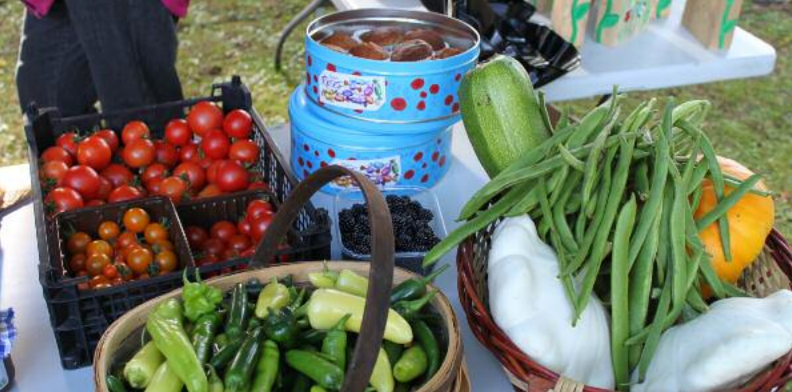
Local and seasonal food. Transition Town West Kirby.