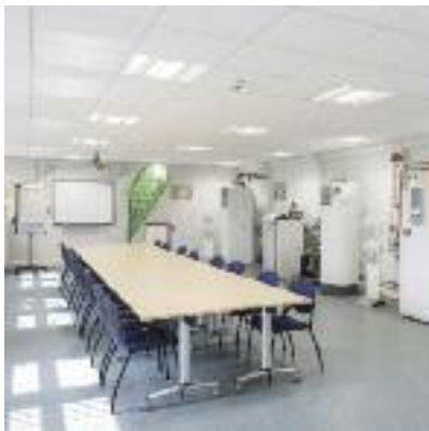
Train in green energy. Stiebel Eltron UK Ltd, Bromborough