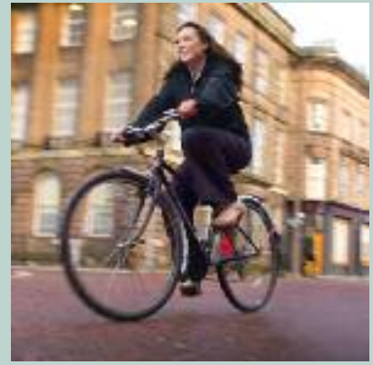
Get on your bike!