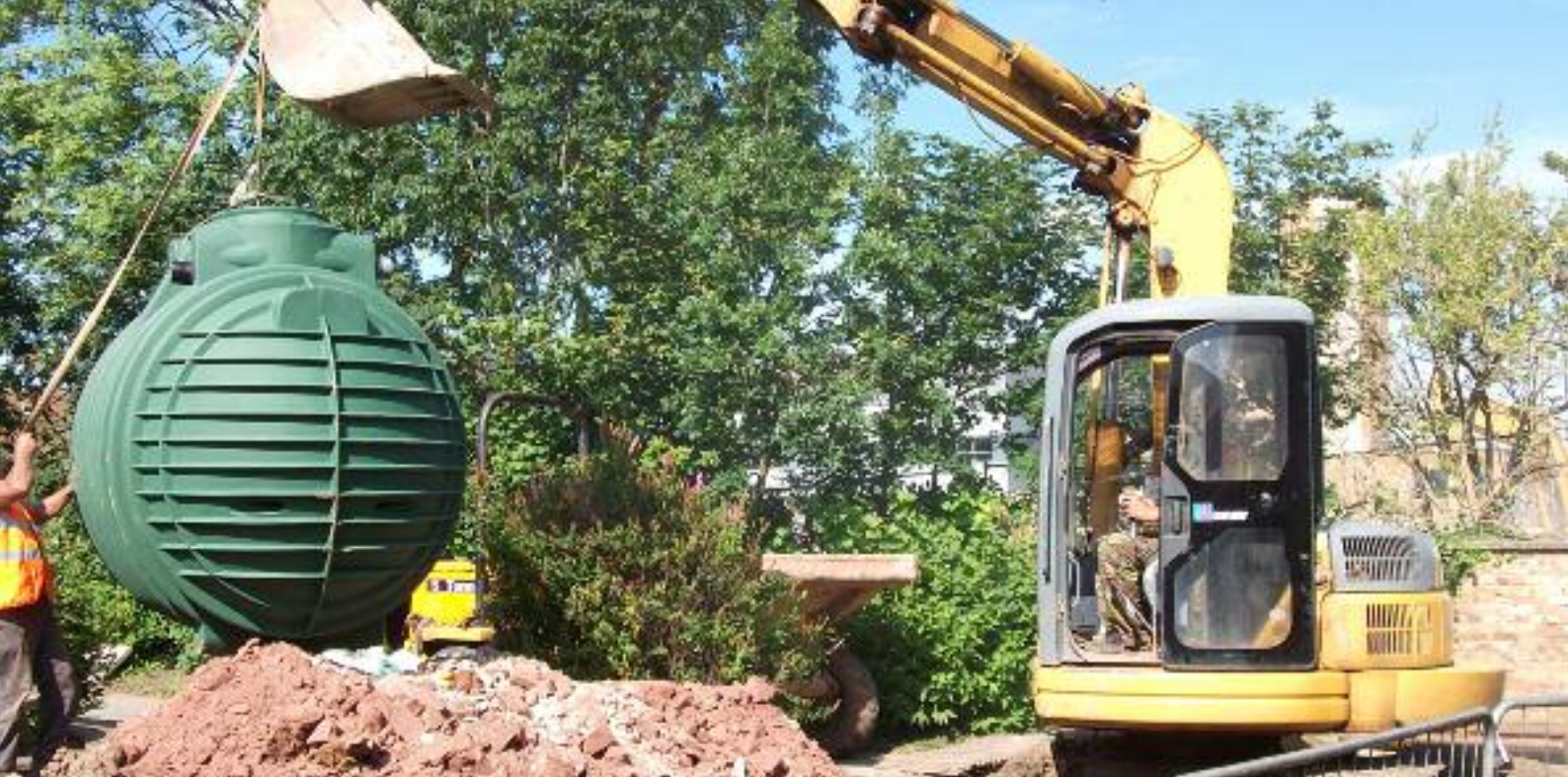
Rainwater harvesting. Raincatcher products and services Ltd, Wallasey.