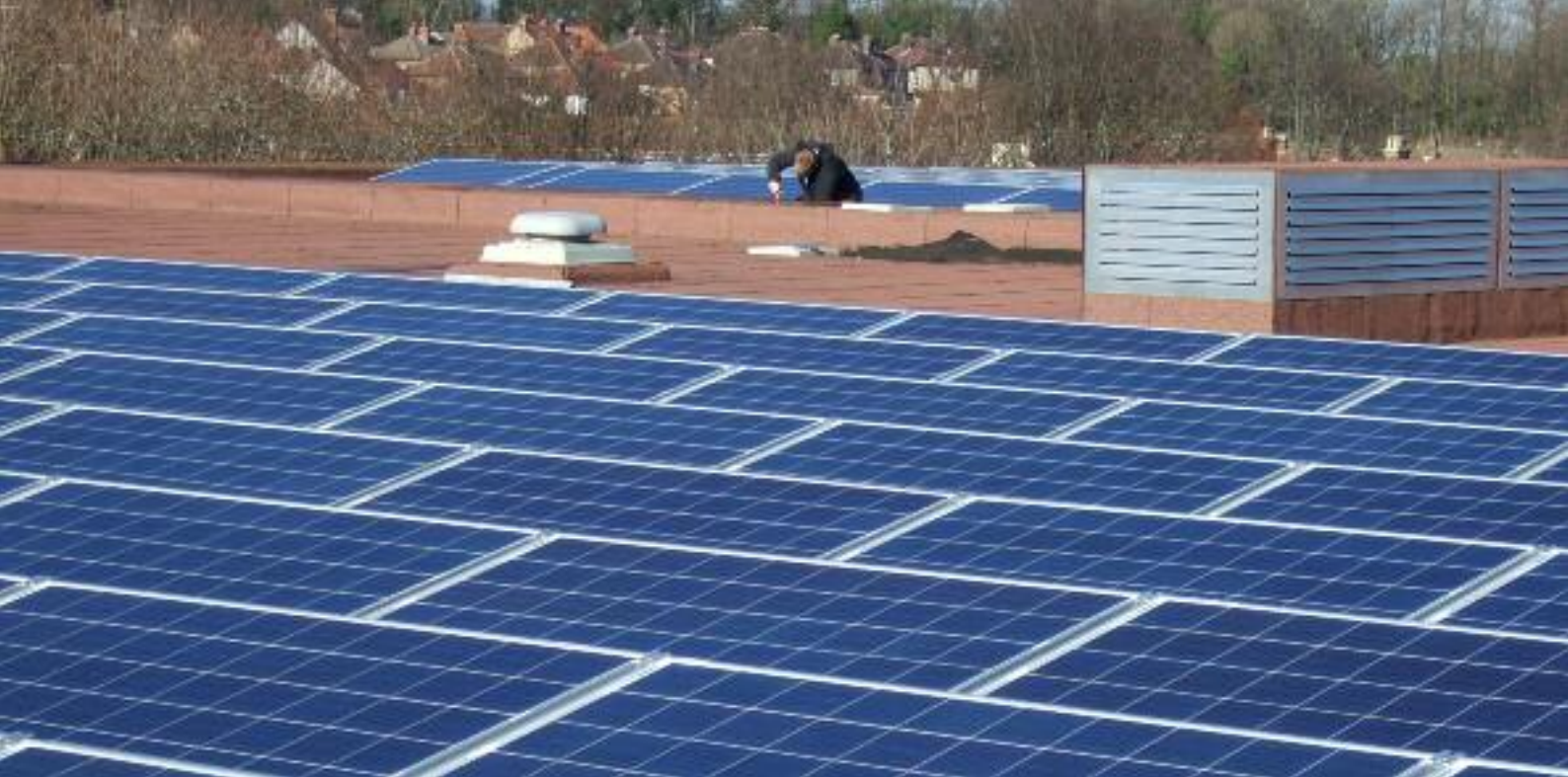
Solar PV installation, Oval Sports Centre